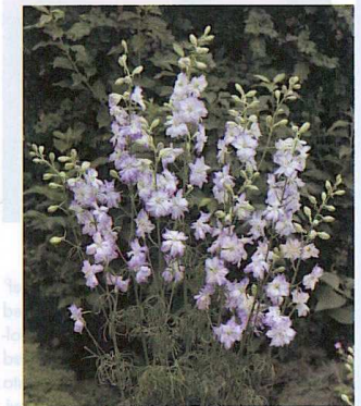
'Sydney Blue Picotee'

'Sydney Blue Picotee' is outstanding because of the color combination of its flowers. While the heart of the flower is white, the edges blend into azure. This cut flower was awarded a Gold Medal for its unusual color scheme. Varieties in the Sydney series are uniform and can be grown extremely well in the controlled conditions of a greenhouse.