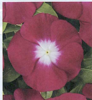
'Pacifica Burgundy Halo'

VINCA 'PACIFICA BURGUNDY HALO' Bedding Plant Award Winner PanAmerican Seed