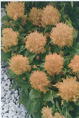
'Fresh Look Gold'

CELOSIA 'FRESH LOOK GOLD' Flower Award Winner Benary Seed