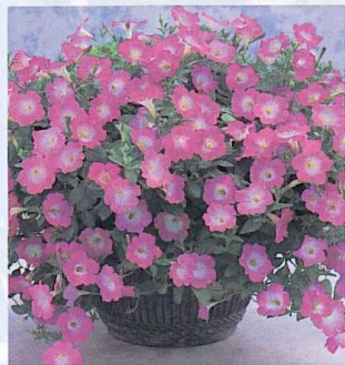
'Opera Supreme Pink Morn'

Iridescent pink blooms are the unique feature of this vigorous trailing petunia. The 2½-inch flowers are pink, shading to creamy white in the center with a yellow throat. 'Opera Supreme Pink Morn' plants flowered continuously at test locations. Plants can spread 3 feet in sunny loca-