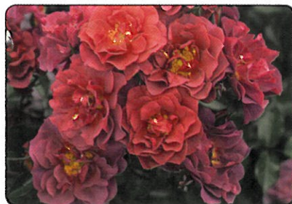
Cinco de Mayo

A floribunda with lavender flowers and a hint of rusty red-orange