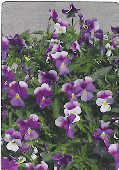
‘Rain Blue and Purple’

‘Rain Blue and Purple’ viola flowers change from purple and white to purple and blue as they mature. This results in a spreading pool of cool blue shades. ‘Rain Blue and Purple,’ bred by Tokita Seed Co. Ltd., spreads 10-14 inches, which is perfect for container plantings or spaces between stepping stones. This cultivar exhibited heat and cold tolerance in trials. In winter Southern trials, it produced color all season. In Northern trials, ‘Rain Blue and Purple’ showed heat tolerance. Flowering